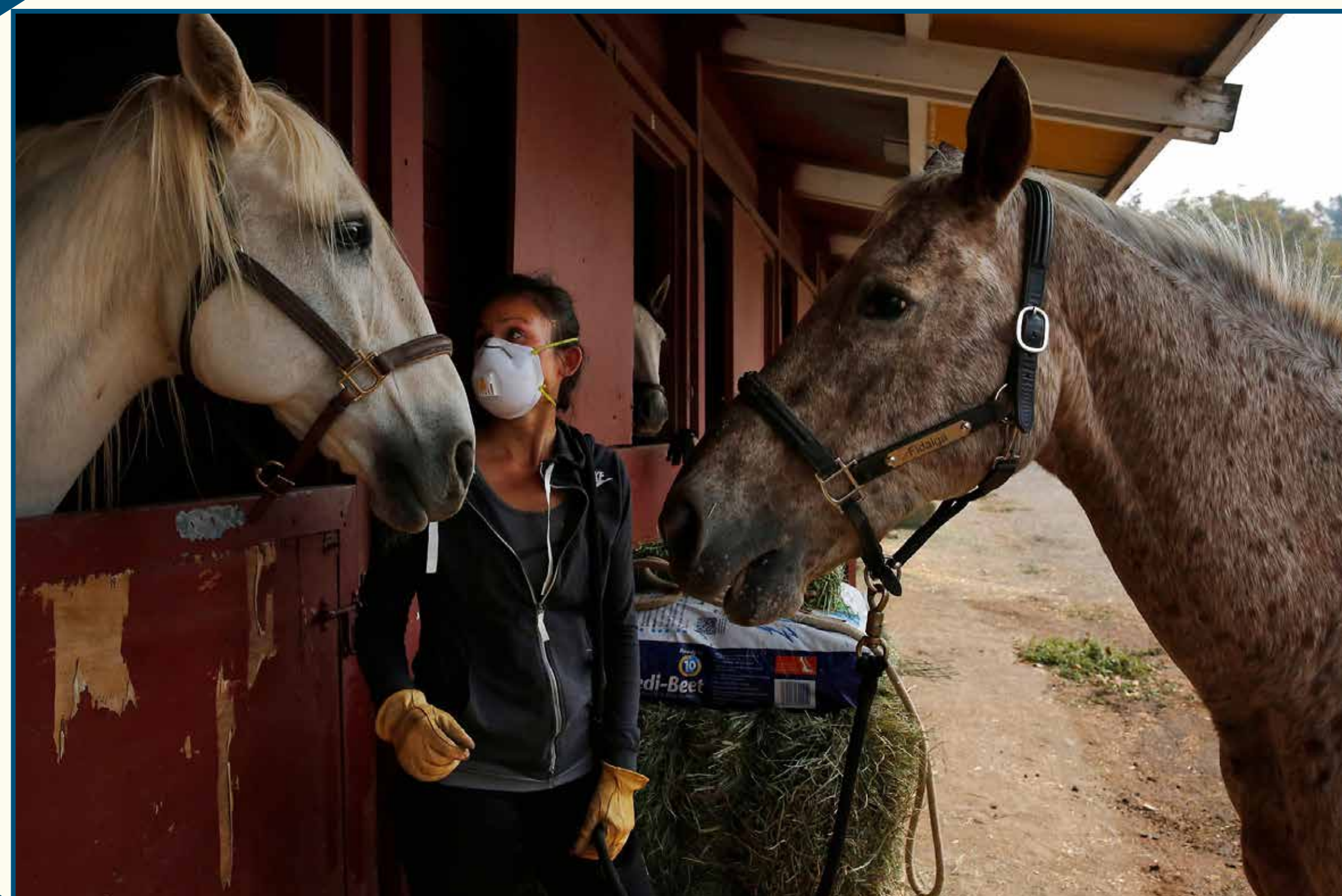
The Sonoma County Fairgrounds during the evacuations