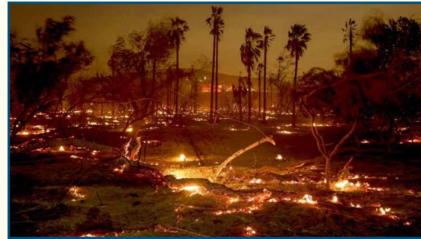
Fires rage in Sonoma County