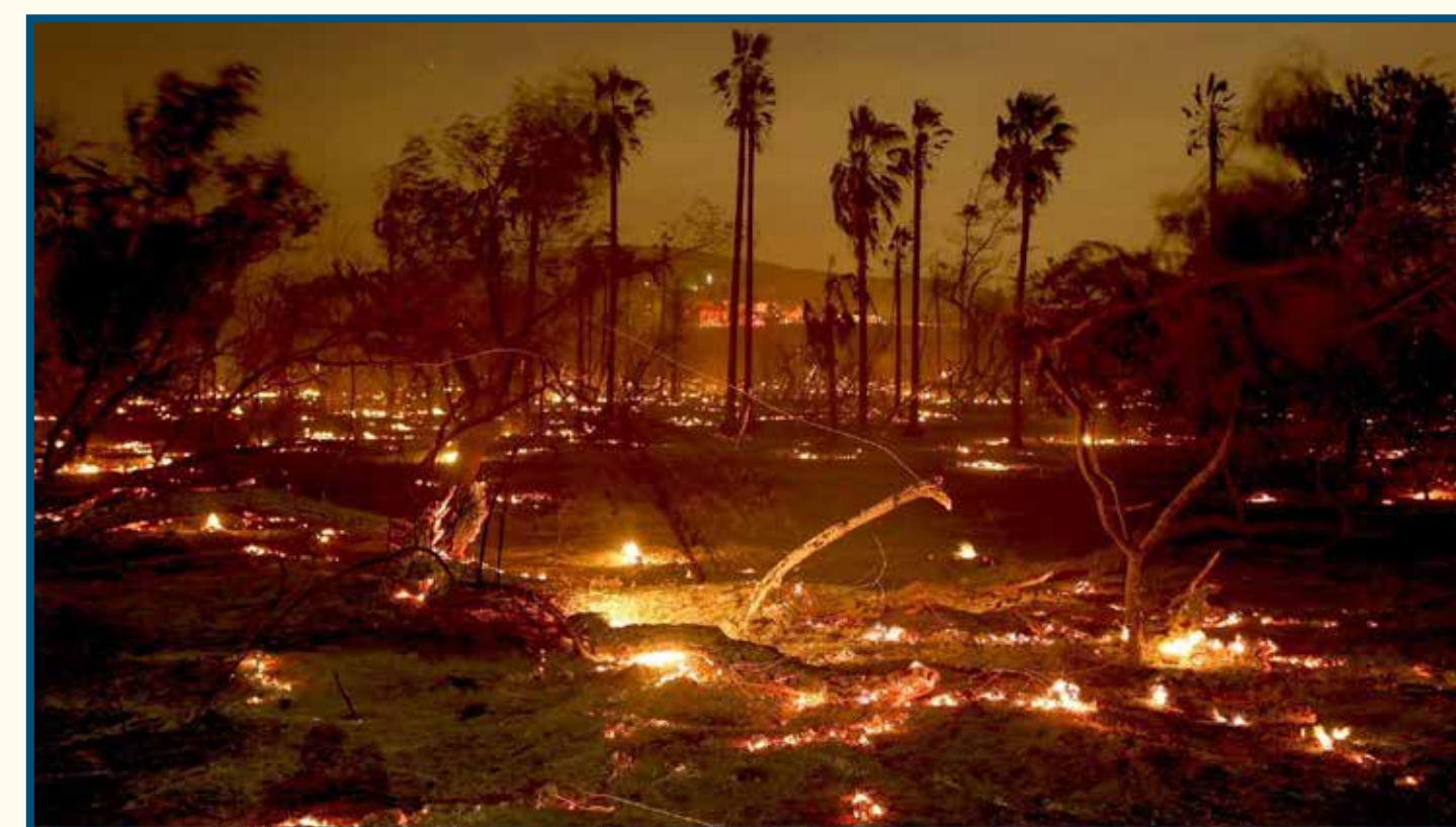
Fires rage in Sonoma County