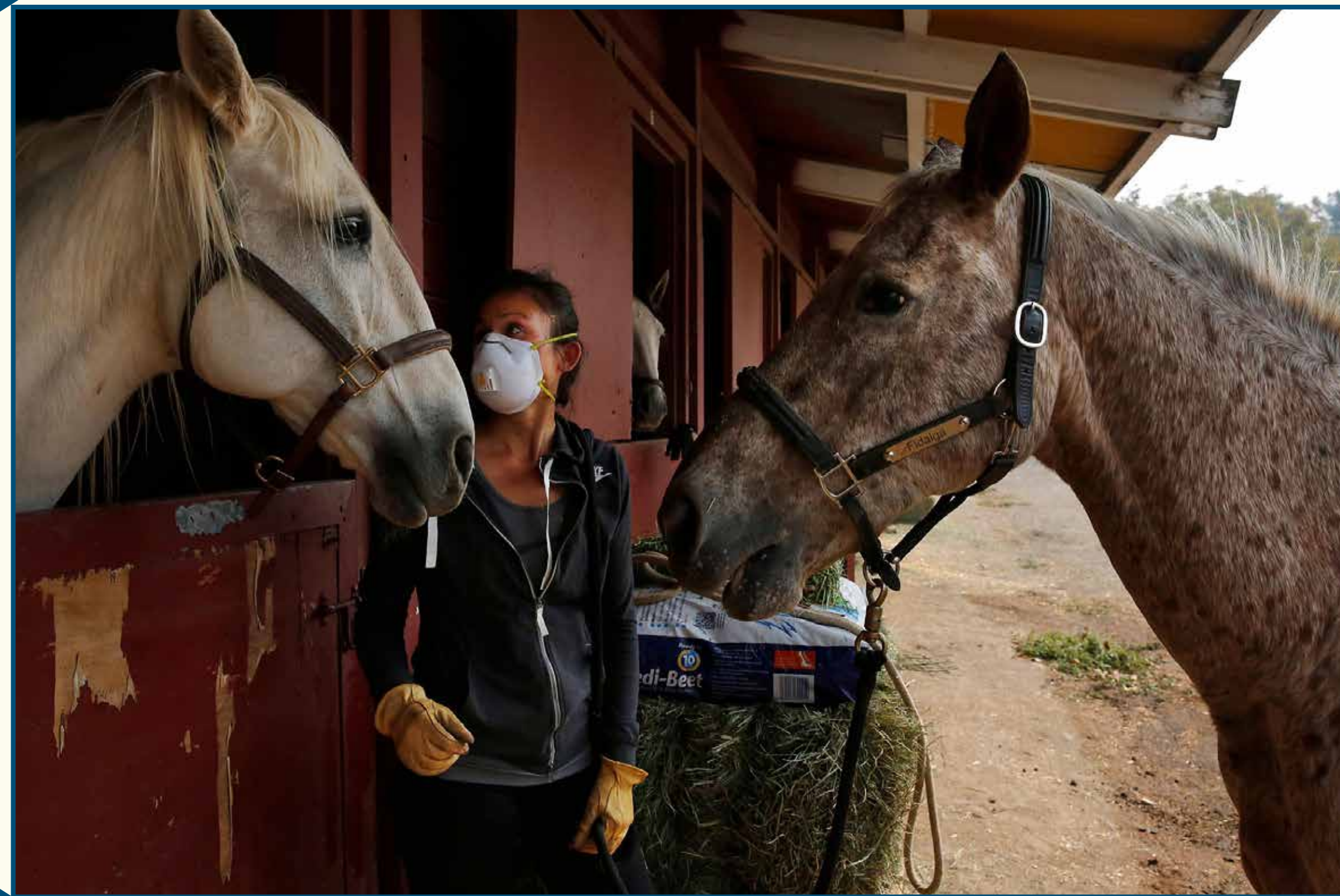
The Sonoma County Fairgrounds during the evacuations